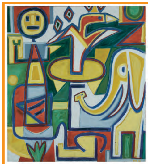
KARAN HAYMAN Zoo 1986 Oil on canvas 168x152.5